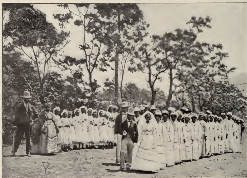
A CHRISTIAN BRIDAL PARTY IN NATAL.